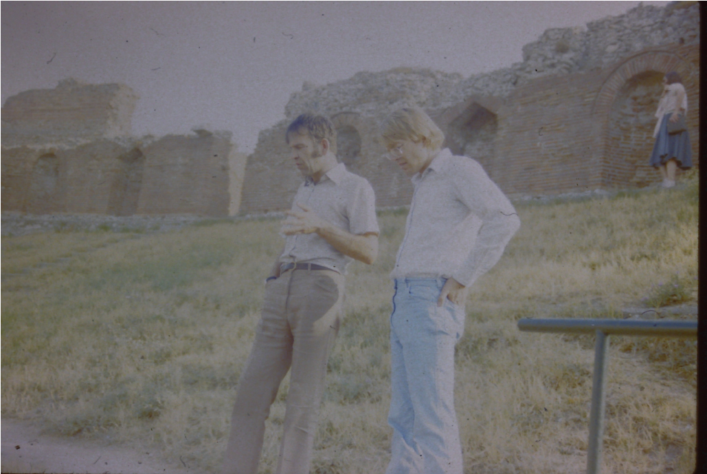
Figure 1. Dziembowski and Goode in 1983 in Catania.

In the early 1990s, we did our most mathematically pure work on stellar oscillations in which we developed a complete formalism, valid through second order in differential rotation ( \Omega(r, \theta) ), describing the effect of rotation on stellar oscillation frequencies (Dziembowski and Goode 1992). We found that second order effects on solar oscillations